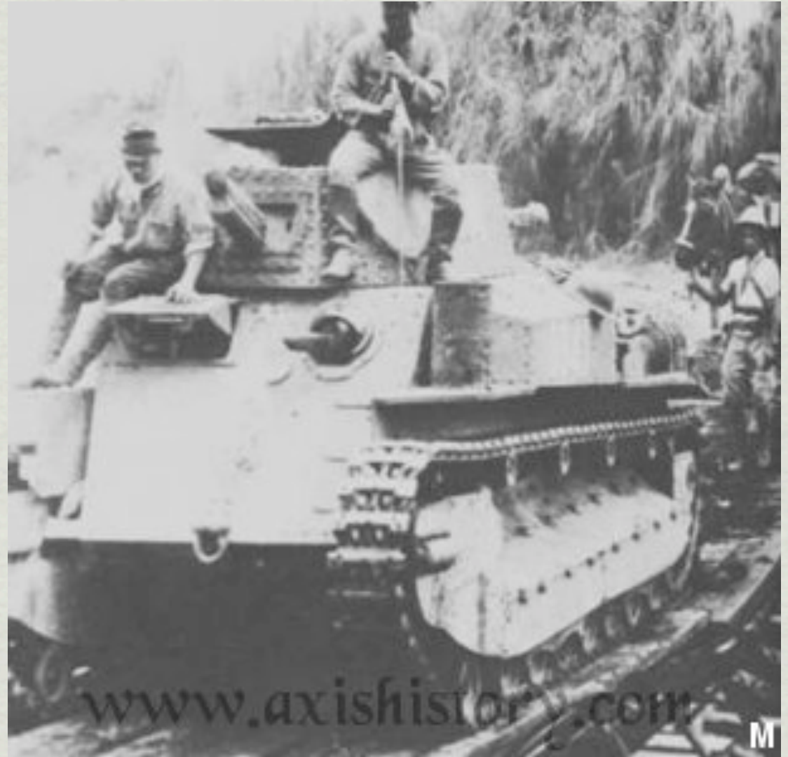
JAPANESE TANK MANCHURIA